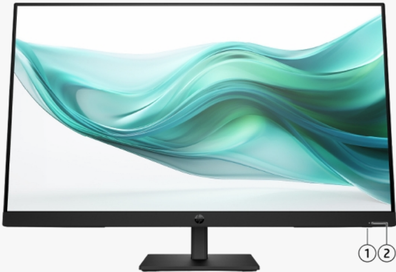
1. Power button