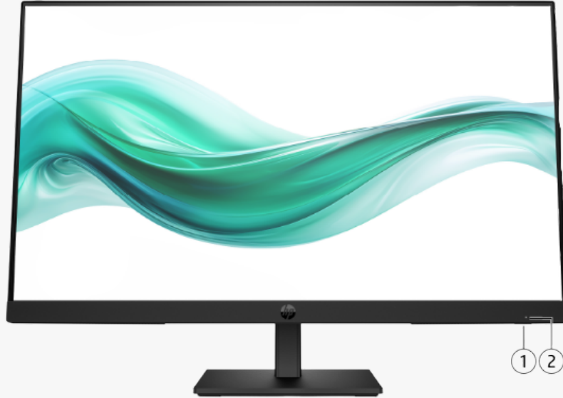
1. Power button