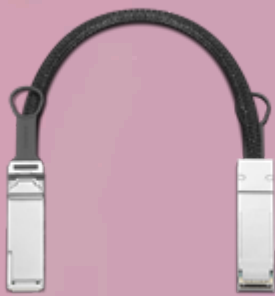
ThinkStation PGX QSFP Link Cable 4X91U42988