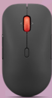
Lenovo Wireless Multi-Mode Pro Plus Mouse 6050 (Eclipse Black) 4Y51S61876