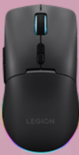
Lenovo Legion M220 Wireless RGB Gaming Mouse GY51U28359